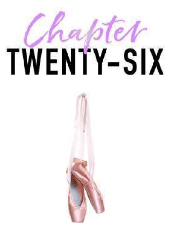
I breathe your name Hoping to fill my lungs With more than just air